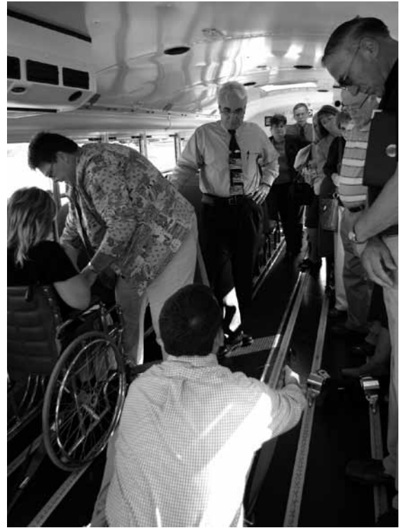
Board members' recent in service topic was transportation.

Wood Lane's spectrum of services includes early intervention, education, employment, daily living skills, and older adult options. Stretchbery emphasized, "We receive great direction from the Board, including financial, education, human service, manufacturing, and public policy guidance. Wood Lane is quite fortunate to have a diverse group of individual members who really make a difference."